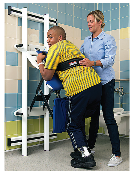
With the kneeboard in use, adjust the trunk board angle to a more upright position to promote increased weight-bearing.