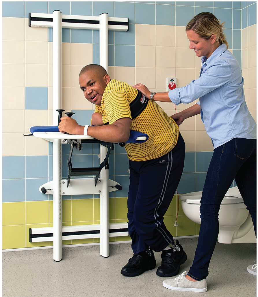
The elbow curves enable a user with limited hand function to assist in a transfer and maintain position on the trunk board.

Beyond toileting: The Support Station can ease the sit-to-stand transition in any setting. Clients can self-assist the stand-pivot transfer from wheelchair to adaptive chair or support themselves in an upright position for clothing changes prior to a swim session.