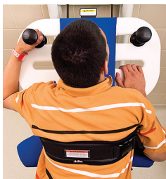
Handholds and slots in the trunk board enable the user to assist in a transfer.