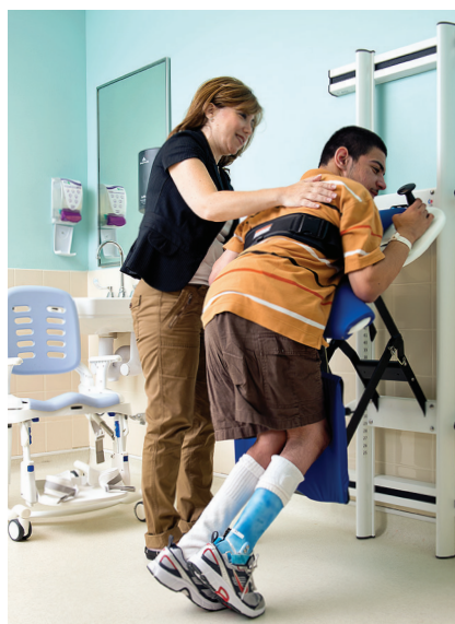
The fixed non-pivot configuration with kneeboard is useful for standing hygiene care, or transfers to commode or wheelchair.