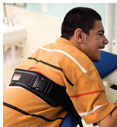
The support strap provides additional security during hygiene care.